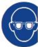
Tightly sealed goggles

· Body protection: Protective work clothing